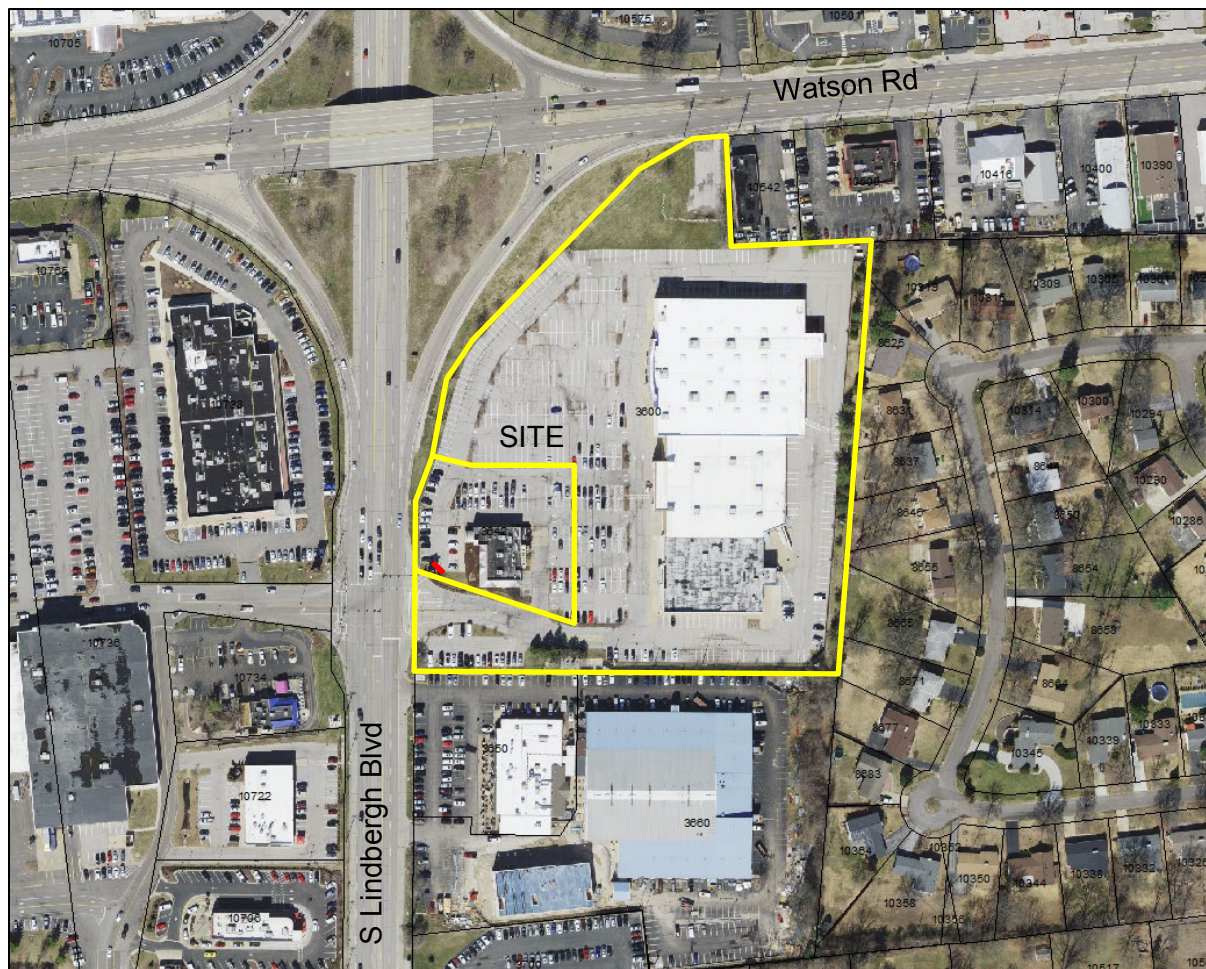
* Maps are for informational use only. Not a representation of the project. — Approximate sign location.