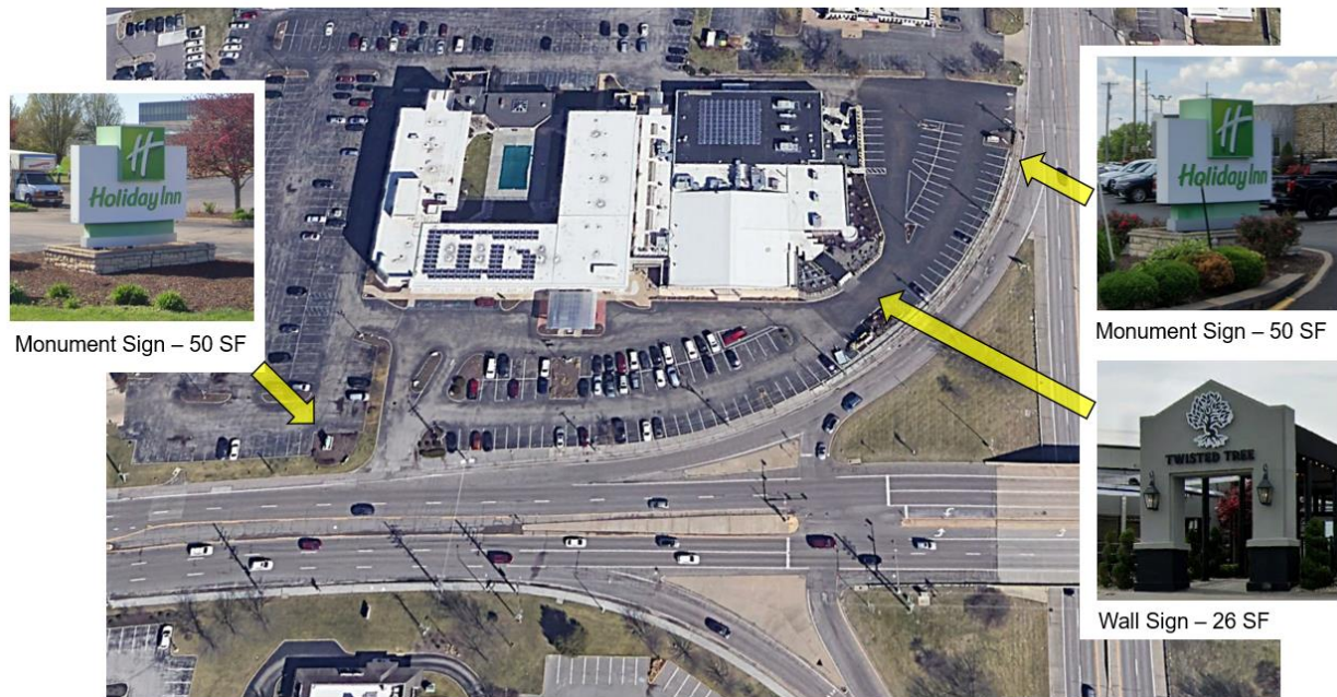
Figure 1: Location of Existing Signs to Remain

The site has 3 existing signs (2 monument and 1 wall). The total existing signage on the site is 126 square feet. The total remaining signage that may be approved, per City Code, on the site is 74 square feet. Below (Figure 1) is an image that provides the general location of the existing signs on the site. It should be noted that the hotel is currently under construction for exterior renovations, but the footprint is in the same approximate location.