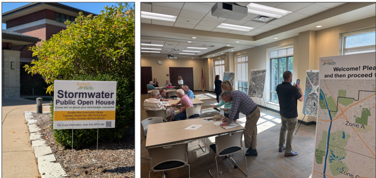
Photo 1 (left): Yard Sign Outside of the Sunset Hills Community Center

The first meeting was held on Tuesday, September 16th, 2025. Approximately 30 people attended this open house. Photo 1 was taken during the public open house held on September 16th. The second meeting was held on Thursday, October 9th, 2025. Approximately 60 residents attended this open house.